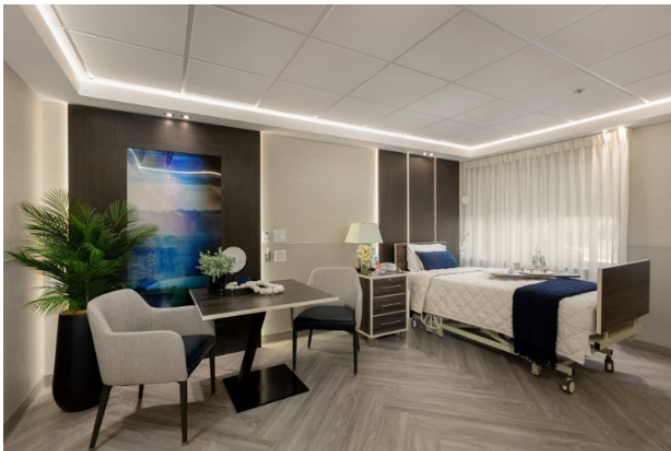
Allaire Health Services' ongoing collaboration with Morristown Medical Center puts residents within arm's reach of New Jersey's leading hospital, as ranked by U.S. News & World Report in its 2022-23 Best Hospital rankings.