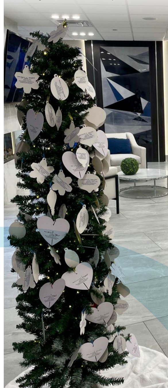
The Giving Tree in Morrisview's lobby

Even after all these years, what keeps both of these valuable members of the Allaire family coming back is not just the fulfilling work but the incredible team at Allaire. It's all about the people they get to work with every day—each contributing to the supportive and collaborative environment that makes Allaire Health Services feel like a second home.