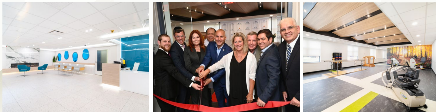
A Joint Assembly Resolution was provided by Assemblywoman Yvonne Lopez and a Mayoral Citation from Mayor Helmin Caba.

Spring Creek's transformation, with 40% of the building makeover complete, was showcased at their June 15th Open House. The crowd filled the lobby, hallways and new state-of-the-art rehabilitation and occupational therapy suite.